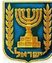
Coat of Arms of the State of Israel, 2013.