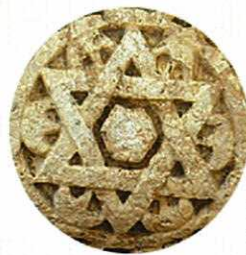
Ancient carving of the Star of David, from a Synagogue at Capernaum, Galilee, Israel. First century CE.