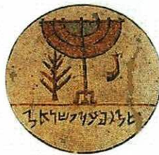
Synagogue floor mosaic, Jericho, Israel, 8th c. CE.