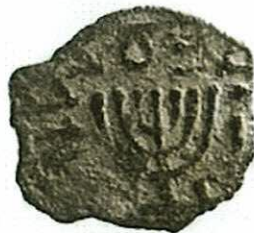
Coin of Matthias, King of Judah, Jerusalem, Israel, 40 BCE.